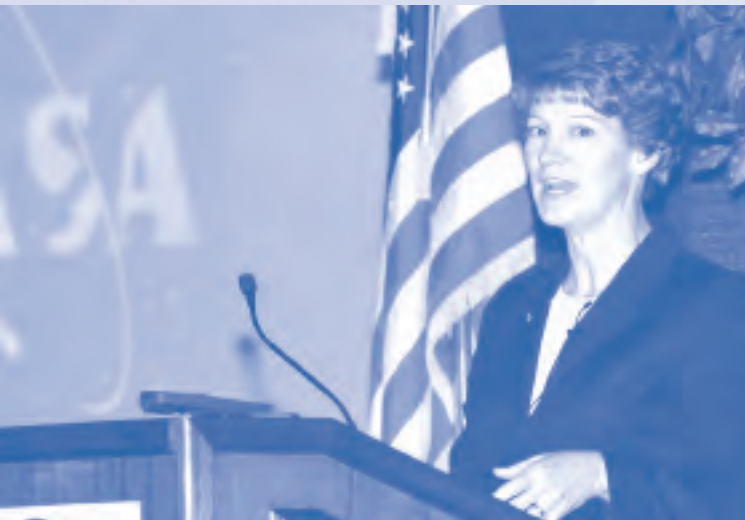
Keynote speaker, astronaut Col. Eileen M. Collins, graduated from Corning Community College and became the first woman to pilot and command an American spacecraft.